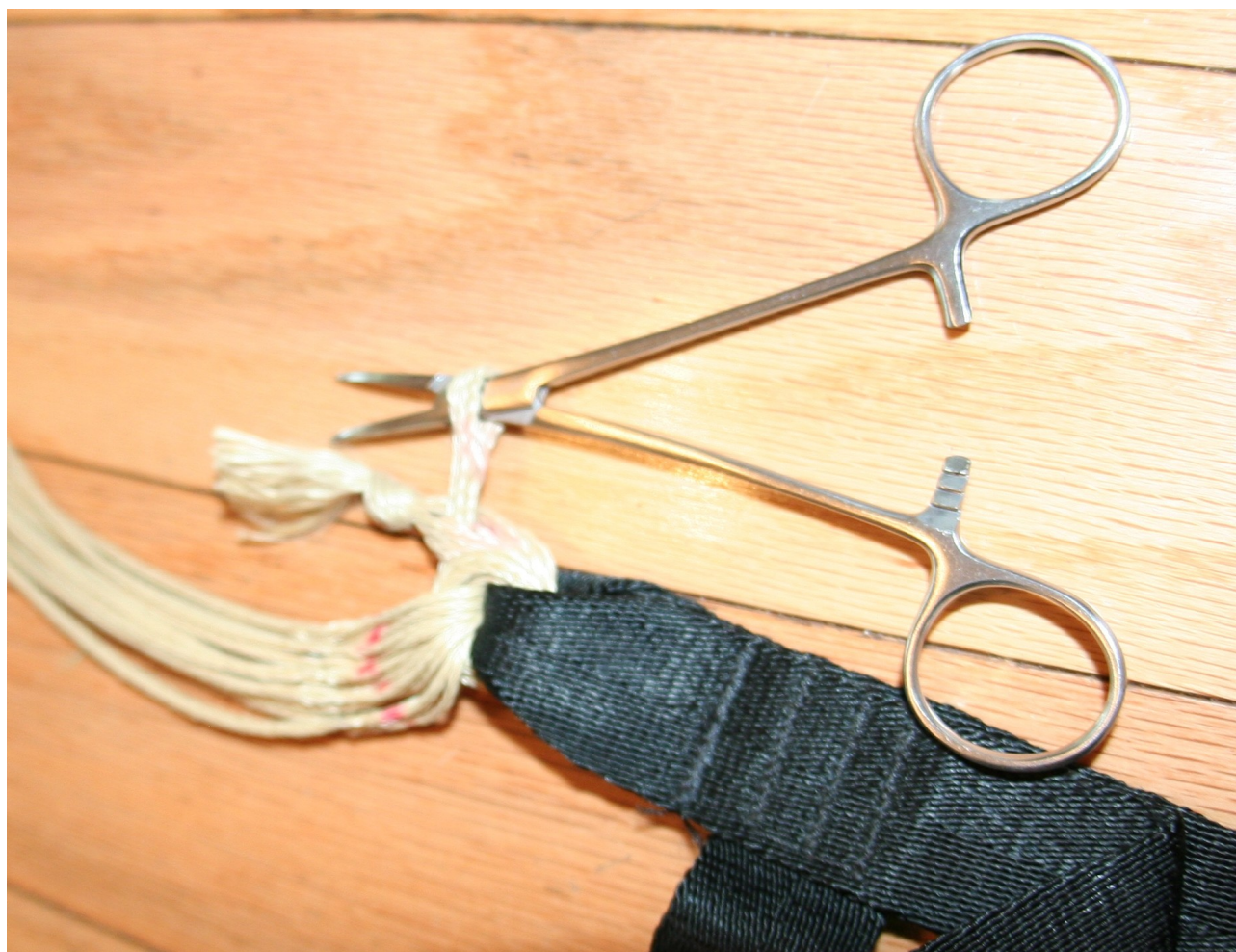
5. Use the hemostats to grab the knot and pass it through the loop-end of the links