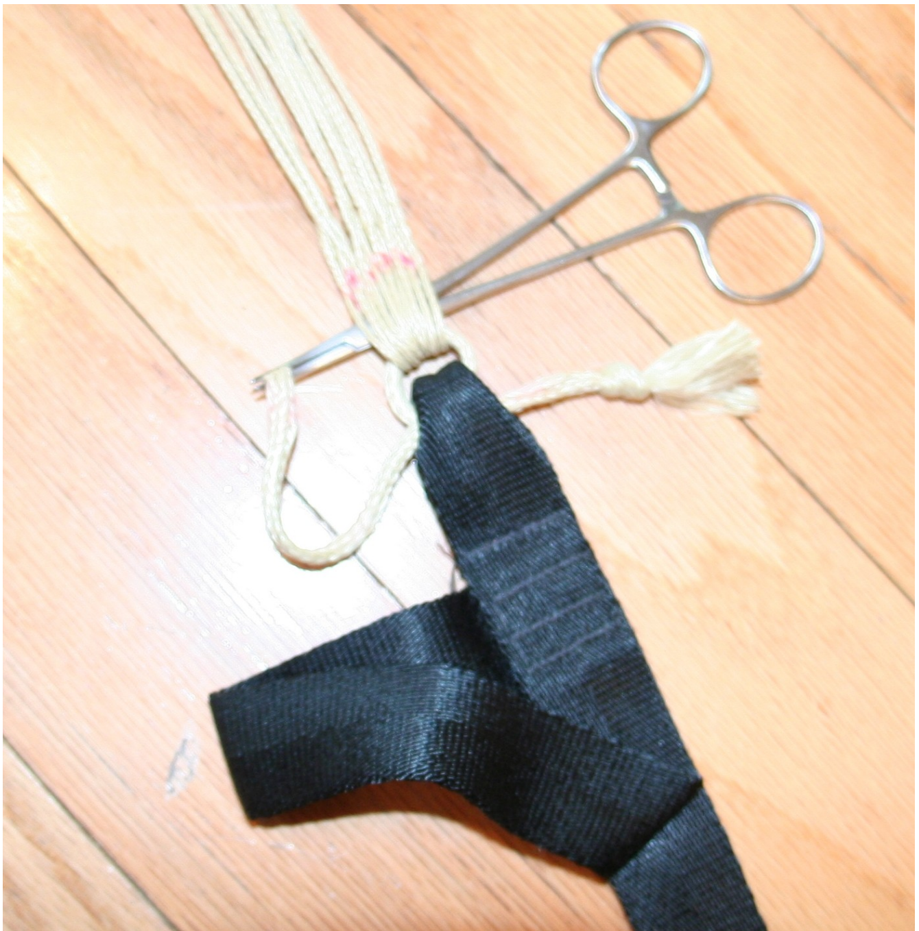
2. Use the hemostats to pull the loop-end of the link through the line loops